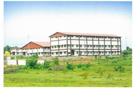
DYEING PLANT AT KANNUR