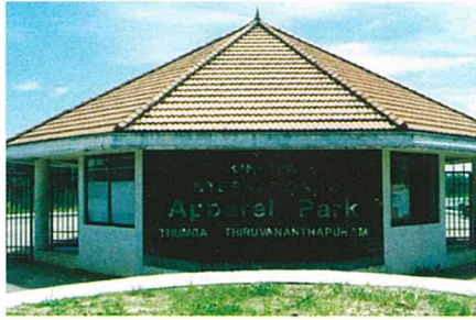
KINFRA INTERNATIONAL APPAREL PARK

The Kerala Industrial Infrastructure Development Corporation (KINFRA) is a statutory body of Government of Kerala. Its objective is to facilitate the development of infrastructure for industries, offering single window for licenses and clearances as required under various statutes.