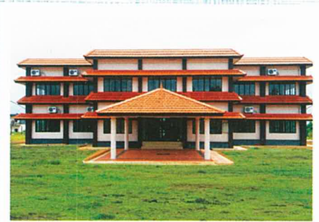
PARK CENTRE AT KANNUR